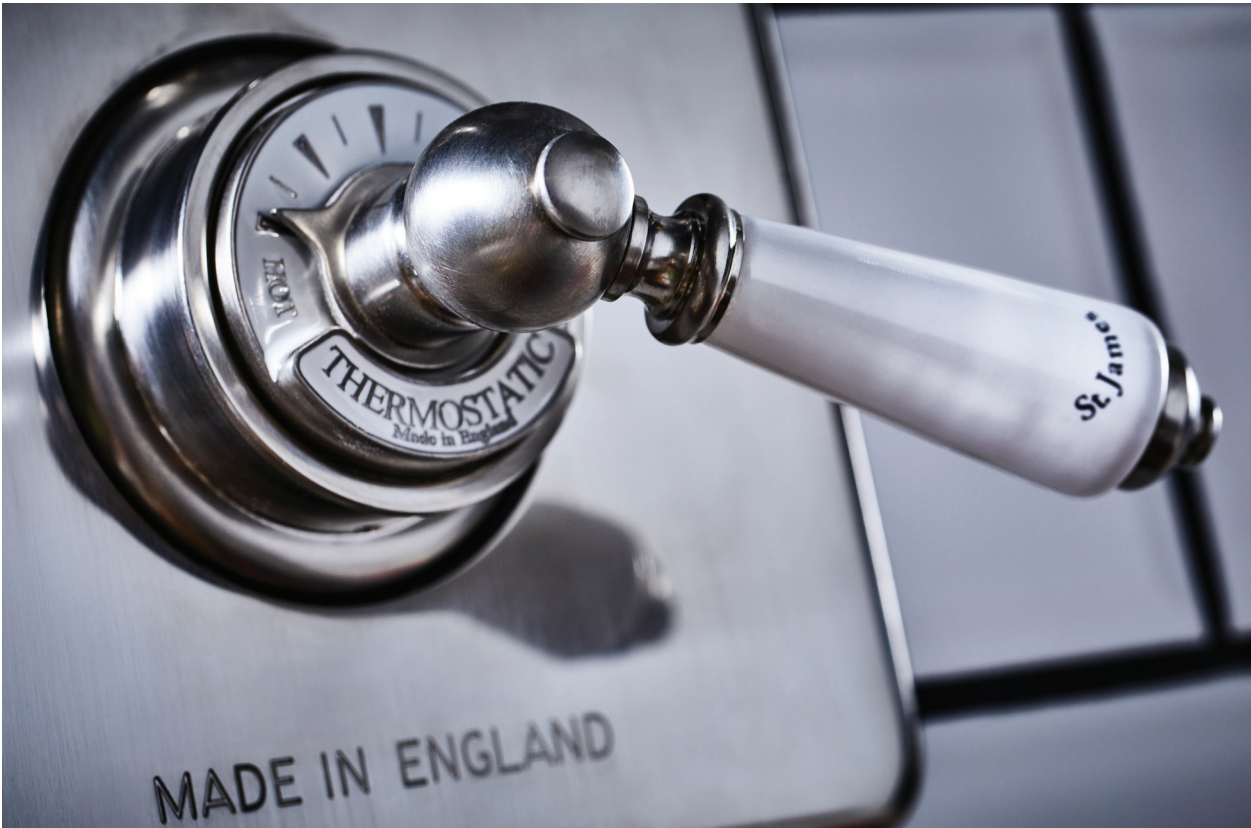
◀ SJ7610BNLL – Traditional concealed thermostatic valve with two function diverter shown with white porcelain London levers. SJK818LRBN – 18mm vertical drop shower arm. SJR08ECBN – 8" easy clean shower rose SJK11BN – Traditional hand shower on wall bracket with our shower wall elbow SJSWEBN.