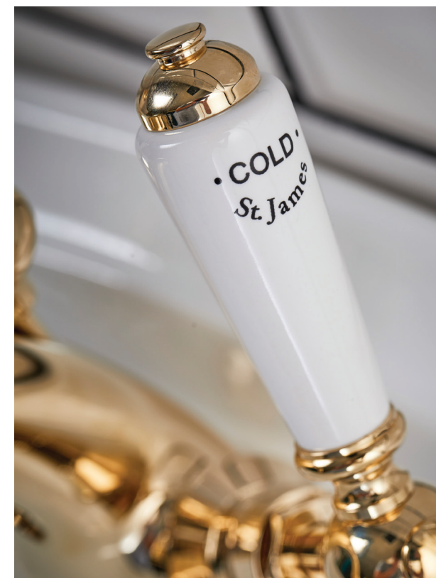
◀ SJ410AGLL – Mono basin mixer with white porcelain London levers.