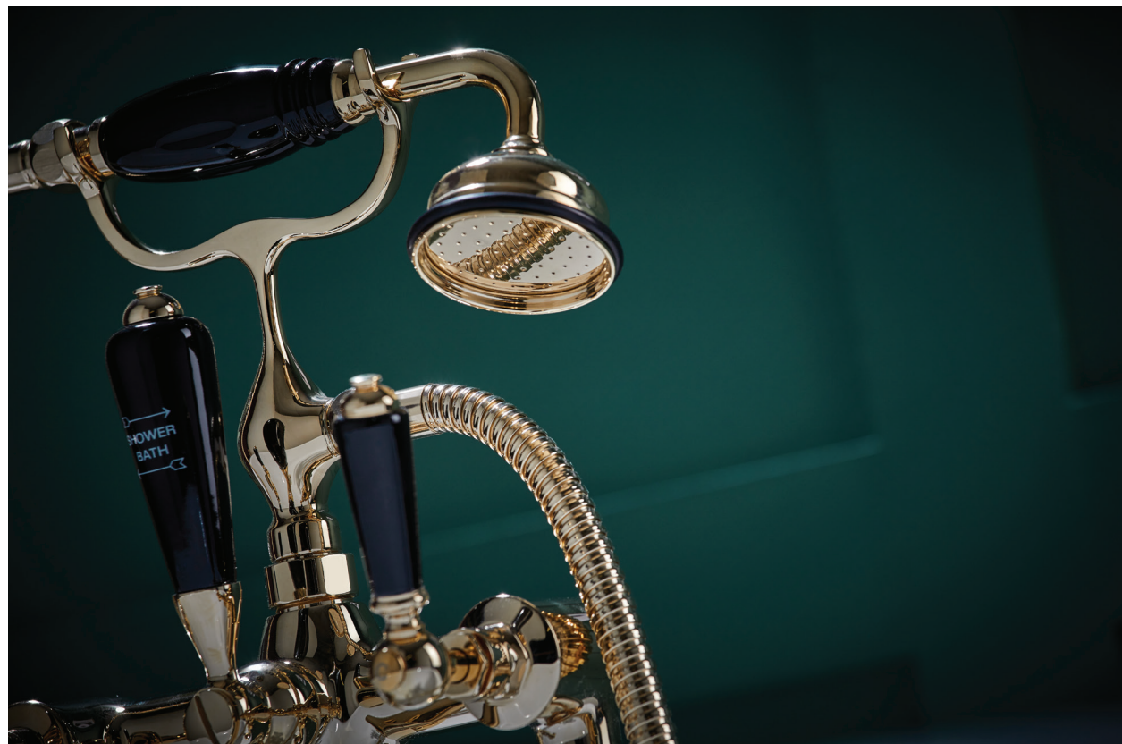
◀ SJ330AGLLBK – Bath shower mixer with cranked legs, black porcelain on London levers, diverter and handshower.