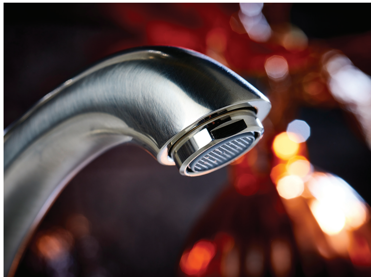
◀ SJ415BNLL – Monobloc basin mixer with white porcelain London lever.