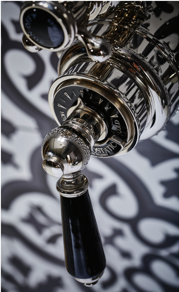
◀ SJ7400NILHLLBK – Traditional exposed thermostatic valve delivering single water outlet with black porcelain London handle and black porcelain London lever. SJK318LRNI – 18mm shower arm and riser rail. SJR08NI – 8" skirted shower rose.