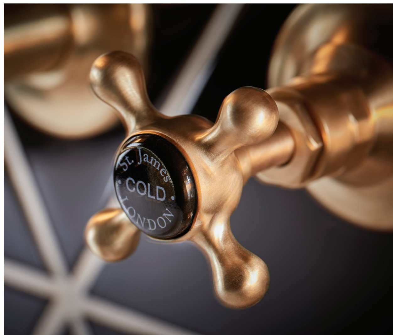
◀ SJ440UBLHBK – Three hole wall mounted basin mixer – long reach spout with London handles and black porcelain indice.