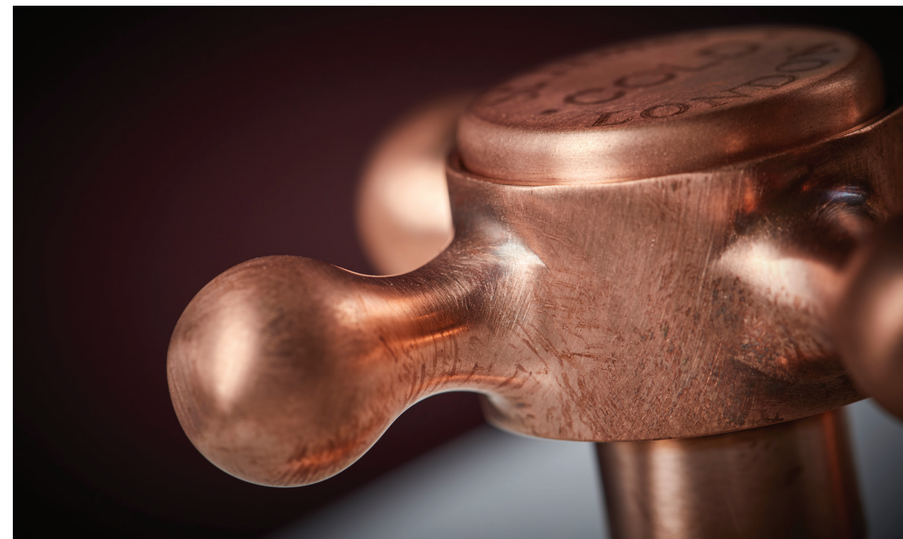
◀ SJ404UCLHMI – Three hole basin mixer showcasing our new spout with London handles and metal indice.