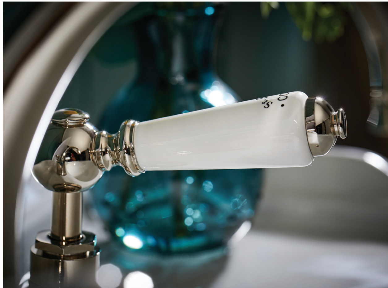
◀ SJ404NILL – Showcasing our new spout with white porcelain London levers.